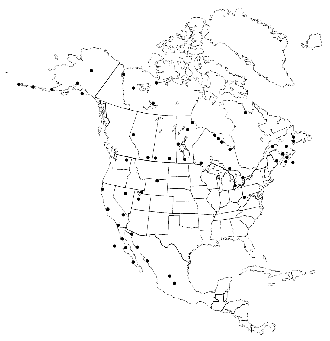
FIG. 1. Distribution of collections of Savannah Sparrows in North America.

Adults of this species undergo a complete Prebasic molt (partial in first-year birds) in the fall that occurs, at least in part, in breeding areas after breeding (Pyle 1997). The molt may be suspended during migration if it is not completed in breeding areas, although this has not been studied. The timing of the molt also may vary geographically. There is a limited Prealternate molt in spring that involves principally head feathers, but may also result in the replacement of some tertials and central rectrices. Thus, birds collected in the breeding season